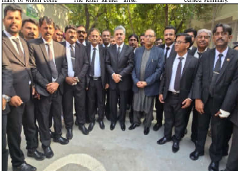
SINDH: The Hon'ble Chief Justice of Pakistan, along with the Chief Justice of the High Court of Sindh, in a group photo with the legal fraternity during their visit to Nanangarpark, Sindh.

Wifaq ul Madaris directed seminary administrators and officials to immediately put an end to these practices and ensure that convocations are kept simple, dignified, and spiritually focused.