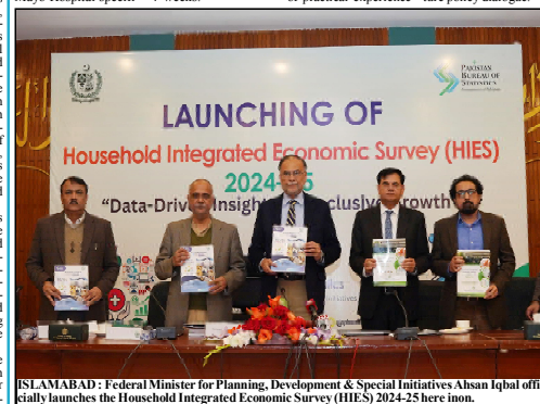
ISLAMABAD: Federal Minister for Planning, Development & Special Initiatives Ahsan Iqbal officially launches the Household Integrated Economic Survey (HIES) 2024-25 here in on.

"Data-Driven Insights for Inclusive Growth"