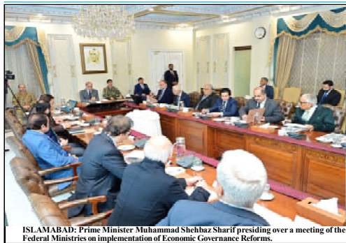
ISLAMABAD: Prime Minister Muhammad Shehbaz Sharif presiding over a meeting of the Federal Ministries on implementation of Economic Governance Reforms.

reduction in high-speed diesel, effective from January 1, 2026. Officials said the reductions aim to pass on the benefits of lower fuel costs to the public, providing immediate relief for commuters across Punjab.