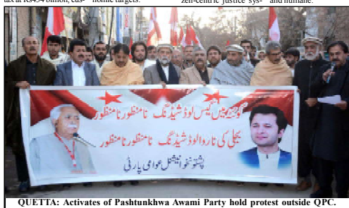
QUETTA: Activates of Pashtunkhwa Awami Party hold protest outside QPC.

The ongoing rain and snowfall have further intensified the cold across northern regions.