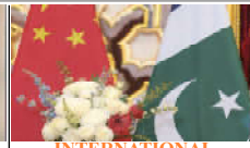
INTERNATIONAL China and Pakistan Renew Commitment to 'Ironclad... Page No 8

SPORT Head hits back for Australia after Root's majestic 160 in fifth Ashes... Page No 7