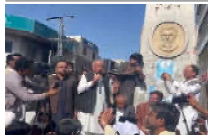
BALUCHISTAN Security Concerns Escalate as Kech Sit-In Continues... Page No 5