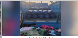
NATIONAL Sindh CTD says major terrorist plot in Karachi foiled; 2,000kg of... Page No 3