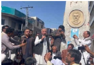
BEFORE THE JUDGE BANKING COURT QUETTA DISTRICT COURT/KACHEHRY SHARA-E-IQBAL QUETTA SUIT NO. 6/2026

Dr. Baloch emphasized sports' role in shaping a civilized society, while DC Bariach highlighted the festival's impact on promoting positive activities.