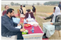
BALUCHISTAN Written Tests & Interviews for Balochistan Sports... Page No 5