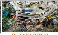
INTERNATIONAL Death toll climbs after trash site collapse buries dozens... Page No 8