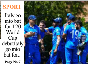
SPORT Italy go into bat for T20 World Cup debut Italy go into bat for... Page No 7

First Digital, Print Daily of Balochistan