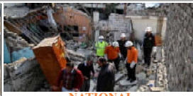
NATIONAL Bride and groom among 8 dead in explosion at Islamabad house, 12... Page No 3