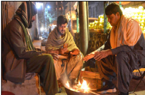
QUETTA: Men sit around the fire to keep themselves warm during cold night in provincial capital.

Traffic authorities also advised citizens to avoid unnecessary travel. People were facing a lot of difficulties in the severe cold wave, as the electricity was also suspended in these areas.