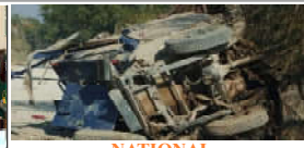
NATIONAL Six policemen, one civilian martyred in K-P IED blast as violence... Page No 3