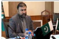
BALUCHISTAN Balochistan CM Announces Fully Merit-Based Online... Page No 5