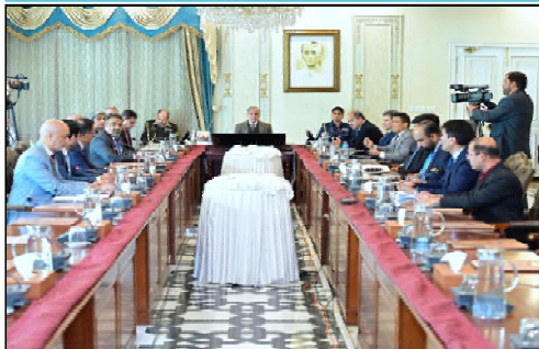
ISLAMABAD: Prime Minister Muhammad Shehbaz Sharif chairs a meeting regarding National Vocational & Technical Training Commission (NAVTC).

in Quetta and Rs 2,600 in Karachi. The latest surge in flour prices has further burdened households already grappling with rising living costs, deepening public concern over inflation.