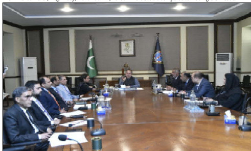
ISLAMABAD: Federal Minister for Maritime Affairs Muhammad Junaid Anwar Chaudhry chairing a meeting on Port Qasim.

Motorway Police said that monitoring teams are deployed on major routes to ensure safety and manage traffic flow as weather conditions evolve.