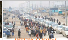
INTERNATIONAL Syrian forces take control of Aleppo's Kurdish areas Page No 8

SPORT ICC unlikely to move Bangladesh T20 World Cup matches... Page No 7