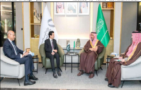
RIYADH: Federal Minister for Petroleum Affairs Pervais Malik held a meeting with H.E. Bandar Ibrahim Al-Khorayef, Saudi Minister of Industry and Mineral Resources on the sidelines of Future Minerals Forum.