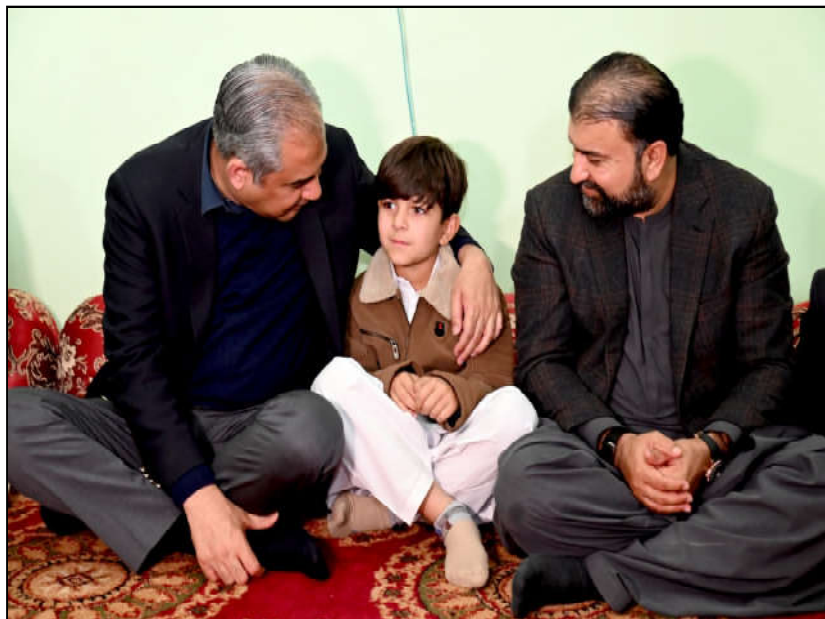
Federal Interior Minister Mohsin Naqvi and Chief Minister Balochistan Mir Sarfraz Bugti express compassion and affection for the son of Shaheed Major Anwar Kakar during their visit to the martyr's family in Quetta.