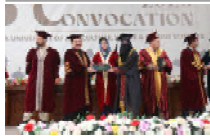
BALUCHISTAN Governor Balochistan Announces Rs. 1 Lakh...