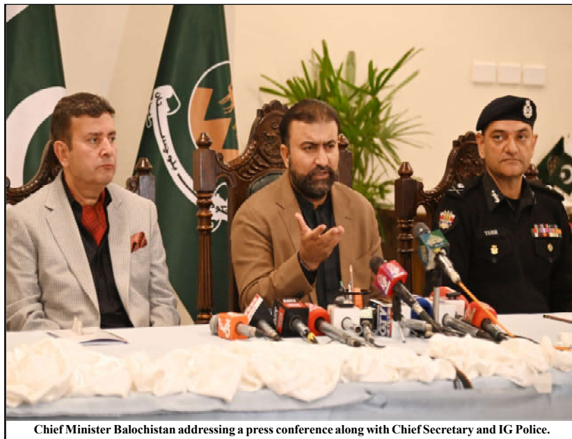
Chief Minister Balochistan addressing a press conference along with Chief Secretary and IG Police.