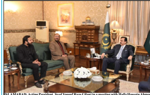
ISLAMABAD: Acting President, Syed Yousuf Raza Gilani in a meeting with Hafiz Hussain Ahmed Madieni at Awan-e-Sadr today.

Basant is returning to Lahore after 18 years, following the passage of the Punjab Regulation of Kite Flying Bill, 2025, by the provincial assembly on December 24.