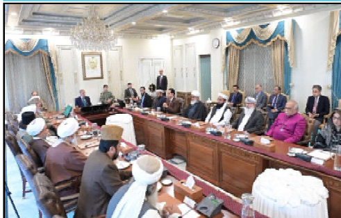
ISLAMABAD: Prime Minister Muhammad Shehbaz Sharif meeting with the National Paigham e Aman Committee.

could become completely polio-free by 2026. The polio workers appreciated the MNA's encouragement and support, describing the interaction as a morale booster for their ongoing efforts in the field.