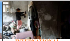
INTERNATIONAL Trump says he supports transi- tional Palestinian panel...