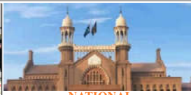
NATIONAL Over 1.4m links blocked as part of actions against unlawful online...