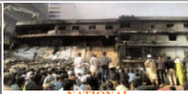
NATIONAL Death toll in Gul Plaza blaze rises to 26 as rescue work continues Page No 3