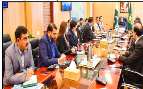
ISLAMABAD: Pakistan Railways' Largest Digitization Initiative: Key Meeting on Railway Advanced Infrastructure Network (RAIN) Project Chaired by Federal Minister Muhammad Hanif Abbasi.

In another sitting, members of the commission continued their review of procedural rules framed under the constitutional amendment to strengthen transparency and consistency in judicial nominations.