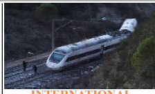
INTERNATIONAL High-speed train collision in Spain kills 39, injures dozens Page No 8

SPORT New Zealand register first ODI series win in India Page No 7