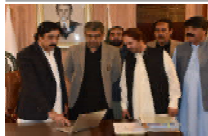
BALUCHISTAN Balochistan Food Authority Launches Live Operation... Page No 5