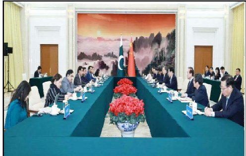
ISLAMABAD: Speaker National Assembly Sardar Ayaz Sadiq led Parliamentary Delegation, met with Chairman CPCC, Mr. Wang Huning at the Great Hall of People in Beijing