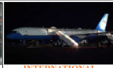
INTERNATIONAL Trump's plane returns to air base after 'minor' electrical...