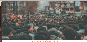
NATIONAL January 21 Observed as Basant Bagh Martyrs' Day in Kashmir