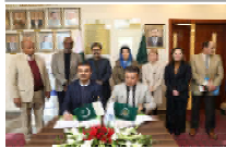
BALUCHISTAN UNHCR Hands Over 48 Solar-Powered Public...