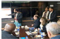
BALUCHISTAN UN Resident Coordinator Commends Balochistan's...