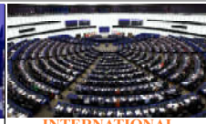
INTERNATIONAL EU commission pledges 126m euros for Pakistan, Iran...

SPORT Abhishek blitzes New Zealand in big India win