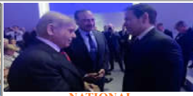
NATIONAL PM Shehbaz, CDF Munir hold meetings on sidelines of World...