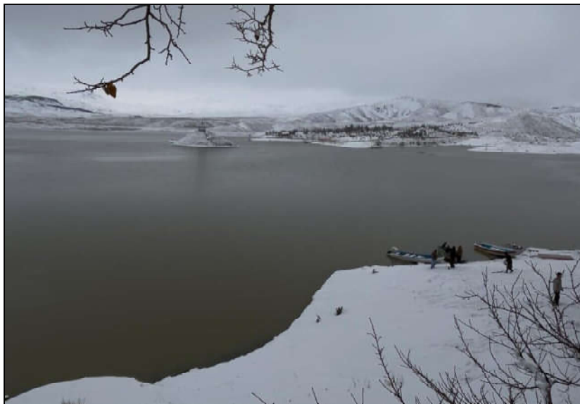
A view of Hana Lake after heavy snowfall.