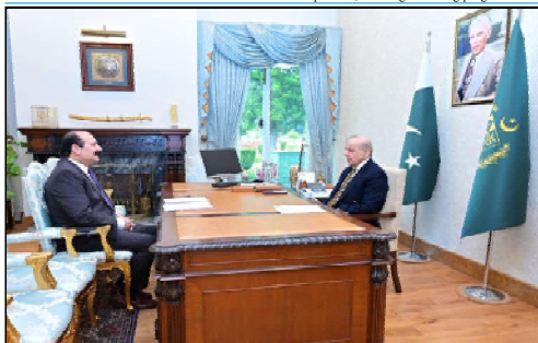
Islamabad: Chairman Prime Minister's Youth Programme Rana Mashhood Ahmad Khan calls on Prime Minister Muhammad Shehbaz Sharif.

over the age of 25 is at risk of stroke. He emphasised that awareness and training for pre-hospital, hospital, and post-hospital stroke care are essential to reduce mortality and long-term disability.