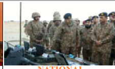
NATIONAL Field Marshal Munir says Pakistan Army shifting to...