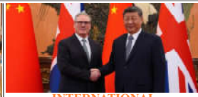
INTERNATIONAL Britain's Starmer seeks fresh economic start with China