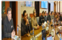
BALUCHISTAN Balochistan Government Takes Comprehensive...