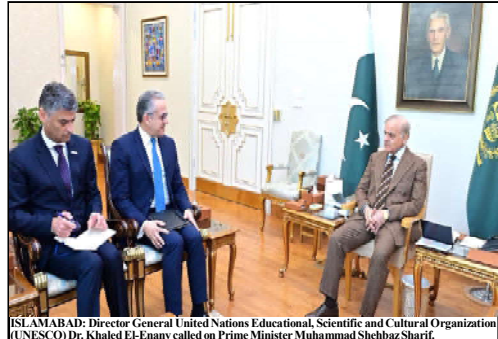
ISLAMABAD: Director General United Nations Educational, Scientific and Cultural Organization (UNESCO) Dr. Khalid El-Enany called on Prime Minister Muhammad Shehbaz Sharif.