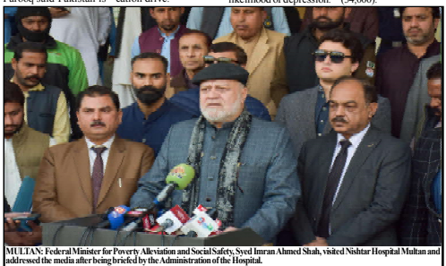
MULLAN: Federal Minister for Poverty Alleviation and Social Safety, Syed Imran Ahmed Shah, visited Nishtar Hospital Multan and addressed the media after being briefed by the Administration of the Hospital.

Smoking is already recognized by the World Health Organization as the leading cause of preventable premature deaths worldwide, responsible for more than eight million deaths each year. While scientists have long suspected a link between smoking and mental health problems, the biological and social mechanisms behind this connection remain unclear. To explore this further, researchers examined how smoking intensity and the length of time since quitting influenced depression risk. The study involved nearly 174,000 participants aged between 19 and 72, with women making up half of the group. Participants were categorized as never-smokers (around 82,000), former smokers (88,000), and current smokers (34,000).