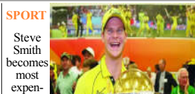
SPORT Steve Smith becomes most expensive player ... Page No 7

First Digital, Print Daily of Balochistan