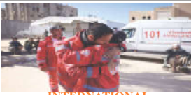
INTERNATIONAL Israeli strikes kill three children, 18 others in Gaza Page No 3