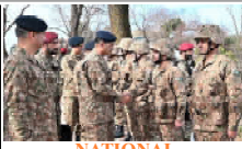
NATIONAL Field Marshal Reaffirms Unwavering Support ... Page No 8