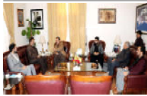
BALUCHISTAN Governor Balochistan Jaffar Khan Mandokhail ... Page No 5