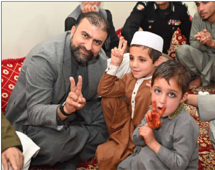
CM Balochistan with Children of Martyred Police Officer in Quetta