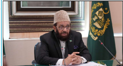
ISLAMABAD: Federal Minister for Religious Affairs and Inter-Faith Harmony Sardar Muhammad Yousof addressing the participants of Ulema and Mashaiikh conference.

In addition, the Finance Minister also drew attention to Pakistan's efforts to align debt management with climate and development objectives, including the issuance of a Green Sukuk and the establishment of a Sovereign Sustainable Financing Framework.