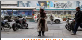
INTERNATIONAL Iran arrests at least four reform front politicians Page No 3