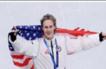
Page No 7