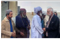
BALUCHISTAN Provincial Minister Sardar Abdul Rehman Khetran... Page No 5