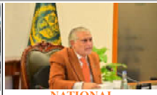
NATIONAL FM Dar underscores importance of expanding ... Page No 8