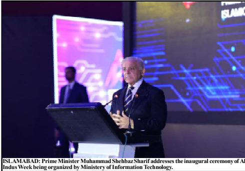
ISLAMABAD: Prime Minister Muhammad Shehbaz Sharif addresses the inaugural ceremony of AI Indus Week being organized by Ministry of Information Technology.

promises has deepened mistrust and uncertainty. "The people have waited patiently. Any further delay will only widen the democratic deficit and further erode faith in constitutional governance," he said.