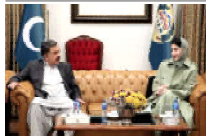
BALUCHISTAN Governor Balochistan Meets Punjab Chief Minister... Page No 5