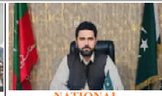
NATIONAL Non-bailable arrest warrant issued for KP CM Afridi... Page No 8