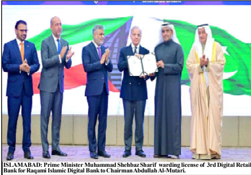
ISLAMABAD: Prime Minister Muhammad Shehbaz Sharif awarding license of 3rd Digital Retail Bank for Raqami Islamic Digital Bank to Chairman Abdullah Al-Mutari.

press the freedom voice and struggle of the people and as a result thousands of youth are incarcerated in jails and many more have been martyred or killed in fake encounters or in police custody.