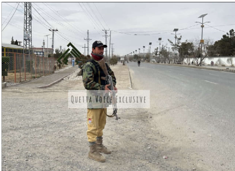
A Police Man Stands Alert In Quetta On The Eve Of Strike: File Photo