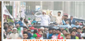
INTERNATIONAL Bangladesh poll race heats up on final day of campaigning Page No 3