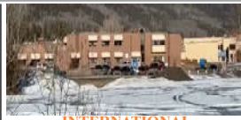
INTERNATIONAL 10 dead after shooter opens fire at high school in Canada Page No 3