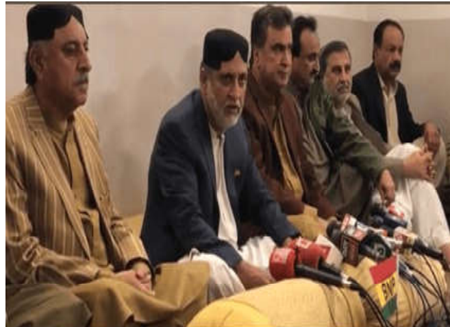
Early in the context of the federal level, the move could have implications and electoral dynamics in the province. Political observers believe

The development paves the way for further steps in line with electoral laws and parliamentary rules. Akhtar Mengal, a prominent political figure from Balochistan, has remained an influential voice on provincial rights and national political matters. His departure from the National Assembly is being viewed as a significant moment in the country's parliamentary landscape, particularly