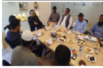
BALUCHISTAN Balochistan Investment Board Reviews Progress... Page No 5