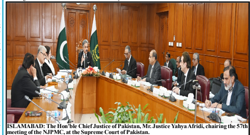
ISLAMABAD: The Hon'ble Chief Justice of Pakistan, Mr. Justice Yahya Afridi, chairing the 57th meeting of the NJPMC, at the Supreme Court of Pakistan.