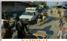
NATIONAL Terrorist attack on police post in Bannu foiled; 3 attackers... Page No 8

SPORT South Africa beat Afghanistan in double super over... Page No 7