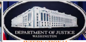
INTERNATIONAL Trump administration moves to fire new US attorney appointed by judges