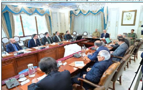
ISLAMABAD: Prime Minister Muhammad Shehbaz Sharif met with delegation of Turkish Agricultural Technologies Cluster TUME.