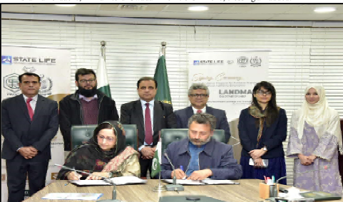
ISLAMABAD: The Pakistan Standards & Quality Control Authority (PSQA) and the Controller General of Accounts (CGA) have formally signed a Memorandum of Understanding (MoU) for the implementation of the Financial Accounting and Budgeting System (FABS).

Beyond mobility, the Orange Line also offered passengers a unique and scenic journey, offering views from modern transportation infrastructure to the vibrant revival of Lahore's cultural heritage and Basant festivities, Gwadar Pro's report added.