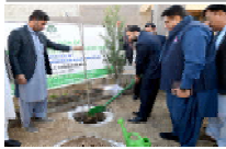
BALUCHISTAN CM Bugti Launches Balochistan Plantation...