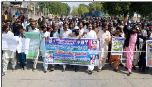
HYDERABAD: Employees of Faram Water Management hold a protest rally in the favor of their demands.