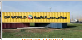
INTERNATIONAL Dubai's DP World replaces leader after he is named in Epstein emails Page No 3