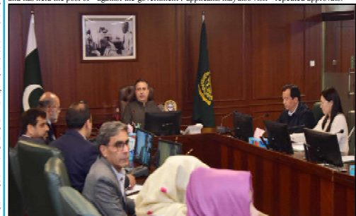
ISLAMABAD: Federal Minister for Maritime Affairs Muhammad Junaid Anwar Chaudhry chairing a high-level review meeting on the Sea-to-Steel initiative at Port Qasim.

In Kashmir, cold and partly cloudy weather is expected, with very cold conditions during early morning and night hours. Gilgit-Baltistan may witness partly cloudy skies along with light rain and light snowfall at isolated locations.