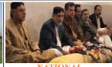
NATIONAL By-Election Schedule Issued for NA-256 Khuzdar Page No 8