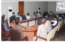
BALUCHISTAN District Coordination & Intelligence Committees ... Page No 5