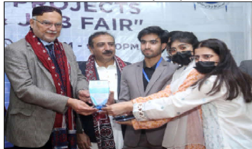
JAMSHORO: Federal minister for planning and development and special initiatives Ahsan Iqbal giving shield to students during DMS Tech Expo 2020 final year projects exhibition & job fair at Sindh University Jamshoro.