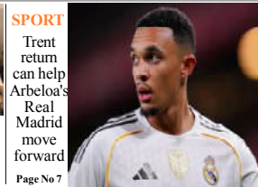
SPORT Trent return can help Arbeloa's Real Madrid move forward Page No 7

First Digital, Print Daily of Balochistan