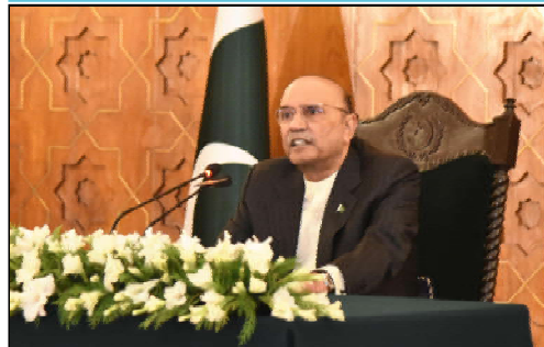
ISLAMABAD: President Asif Ali Zardari addresses the participants of the 6th International Workshop for Leadership and Stability (IWLS) during an interactive session at Aitwan-e-Sadr.

ions. The PBF President reaffirmed that the joint commitment of the Pakistan Boxing Federation and the Pakistan Army is to elevate Pakistan boxing to a competitive and respected position on the global stage.