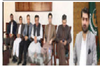
BALUCHISTAN Deputy Commissioner Chairs Key Meeting... Page No 5