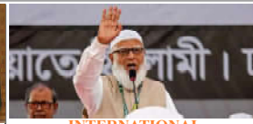
INTERNATIONAL Bangladesh's JI-led coalition submits poll complaints Page No 3