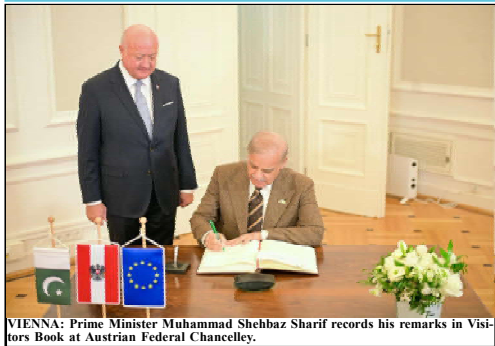
VIENNA: Prime Minister Muhammad Shehbaz Sharif records his remarks in Visitors Book at Austrian Federal Chancellery.

He also voiced optimism that bilateral engagement would help both countries advance shared goals of stability and prosperity. The oath-taking ceremony comes in the wake of a decisive electoral outcome. The Bangladesh Nationalist Party secured more than a two-thirds majority in the 13th national parliamentary election, enabling it to formally initiate the formation of a new government.