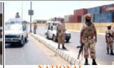
NATIONAL Rangers, Counter-Terrorism Department (CTD) arrest... Page No 8

SPORT Brignone strikes Olympic gold again as Klaebo becomes first to win nine Page No 7