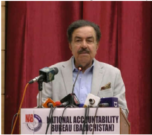
The Governor offered heartfelt condolences to the departed soul of Ayatollah Khamenei and extended condolences to the government and people of Iran.