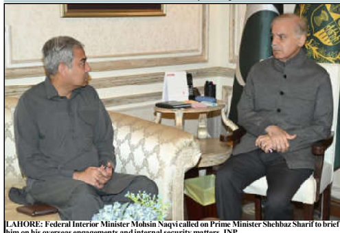
LAHORE: Federal Interior Minister Mobsin Naqvi called on Prime Minister Shehbaz Sharif to brief him on his overseas engagements and internal security matters.

schools of thought to guide the public toward maintaining peace and order. He also expressed his deep sorrow over the loss of lives in the U.S. Consulate incident. The government cannot allow anyone to take the law into their own hands, the Chief Minister said. He directed the administration and police to ensure that law and order are maintained at all costs.