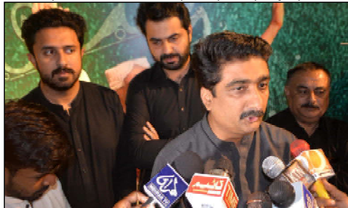
HYDERABAD: Sindh Minister for Culture, Tourism and Antiquities Syed Zulfikar Ali Shah talking to media at Sindh Museum.

During the meeting, relevant departments presented separate and detailed briefings on security measures, counter-terrorism strategies, street crimes, narcotics control, and other criminal activities.