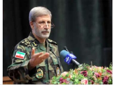
Iran's army chief Amir Hatami speaking at a press conference in Tehran, Iran, on Thursday.

course that denies the inalienable rights and the very existence of the Palestinian people in the Occupied Palestinian Territory." They described the legislation as "a dangerous escalation, particularly given its discriminatory application against Palestinian prisoners," adding that "such measures risk further exacerbating tensions and undermining regional stability."