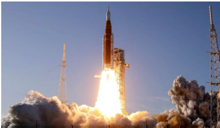
Nasa's Artemis II Space Launch System rocket carrying the Orion spacecraft lifts off from Launch Complex 39B at Kennedy Space Centre on April 1, 2026 in Cape Canaveral, Florida.

crew consisting of Nasa astronauts Reid Wiseman, Victor Glover and Christina Koch, plus Canadian Space Agency astronaut Jeremy Hansen, will fly around the moon and back in their nearly 10-day expedition, putting the spacecraft through its paces while venturing deeper into space than humans have ever gone.