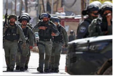
Soldiers in military gear standing in a line, possibly during a training exercise or a security operation.