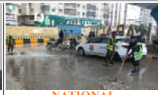
NATIONAL At least 4 killed as heavy rain lashes Karachi, city... Page No 8