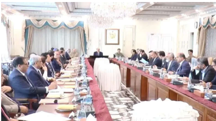
Prime Minister Shehbaz Sharif (center) leads a high-level meeting with provincial chief ministers and federal ministers to discuss the global oil crisis.

He also highlighted the government's initiatives to protect the economy and the com-