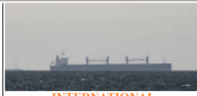
INTERNATIONAL UK to host talks with 35 countries on reopening Strait of Hormuz Page No 3