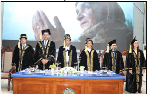
ISLAMABAD: Federal Minister for Education and Professional Training Dr. Khalid Maqbool Siddiqui attended Convocation Ceremony at Islamabad Model College for Girls (PG).

At the same time, growing sesame seed imports are supported by rising demand in China's food sector, particularly in edible oils and processed products, reinforcing the role of agriculture in strengthening bilateral trade ties.