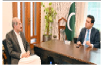
BALUCHISTAN Balochistan Officials Discuss Flood Situation... Page No 5