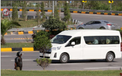
ISLAMABAD: A VIEW OF US CONVOY CAME OUT NUR KHAN AIR BASE AFTER REACHED IN PAKISTAN, AHEAD OF THE UNITED STATES AND IRAN POSSIBLE NEGOTIATIONS IN PAKISTANI CAPITAL, IN ISLAMABAD.

The world was on the brink of war, and that was stopped by them, at least for now," she said. "Pray to God this ceasefire holds, and Iran gets the victory. Iran's victory is the victory of the Muslim Ummah. Ayatollah Ali Khamenei's sacrifice united Shias and Sunnis. Does anybody say today he is Shia and I am Sunni? We are all Muslims today," she said.