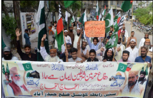
HYDERABAD: Activists of Sunny Rabta Council hold a protest in favour of their demands outside HPC.

ISLAMABAD, (INP): The Ministry of Information and Broadcasting has issued an important clarification regarding petrol prices and diesel rates, stating that no official notification has been released for any change. According to the ministry, a notification circulating on social media about revisions in petrol rates and diesel prices is fake and misleading. Authorities urged the public to rely only on official sources and verified announcements to avoid confusion. The ministry further stated that a decision regarding changes in fuel prices is expected to be made tomorrow, indicating that no final announcement has been issued so far. Sources suggest that, following a decline in global oil prices, petrol rates in Pakistan could see a significant reduction. Diesel rates may drop by as much as Rs90 to Rs100 per litre, while petrol rates could decrease by Rs50 to Rs60 per litre. However, the final decision on petrol prices and diesel rates will be announced only after approval from Prime Minister Shehbaz Sharif. It is worth noting that after recent record increases in petroleum prices, both federal and provincial governments had already announced relief packages for various sectors, including motorcycle, rickshaw drivers, goods transport operators, public transport, and farmers.