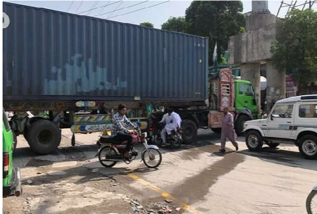
Chowk to Airport Road, along with link roads and streets, was also closed, forcing residents to remain confined to their homes.