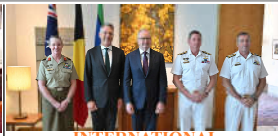
INTERNATIONAL Australia appoints woman to lead its army for the first time Page No 3