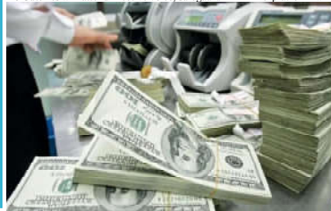
Hands holding banknotes, symbolizing debt or finance.

Developing countries' external debt burden reached $11.7 trillion in 2024. In 2024, they spent almost 10 per cent of government revenue on interest payments to creditors abroad. Least developed countries pay nearly a quarter of their revenue to external creditors. 34 countries, home to 3.4 billion people, now spend more on debt than on health or education.