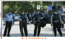
NATIONAL Four officials hurt as Afghan residents clash with police... Page No 8