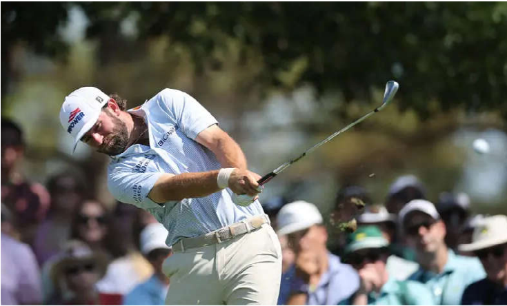
McIlroy (left) and Young (right) are tied for the lead at the Masters on Saturday. McIlroy (left) and Young (right) are tied for the lead at the Masters on Saturday.

Young, last month's Players Championship winner, got off to a scorching start with Jack Nicklaus and Nick Faldo as the only back-to-back winners of the green jacket.