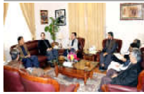
BALUCHISTAN Plan to Establish University of Balochistan Campus... Page No 5