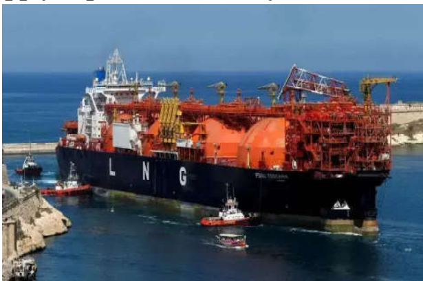
Power plant in Islamabad.

However, fertiliser plants may not receive uninterrupted gas and could be operated on an