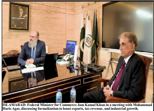
ISLAMABAD: Federal Minister for Commerce Jam Kamal Khan in a meeting with Mohammad Harris Agar, discussing formalization to boost exports, tax revenue, and industrial growth.