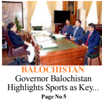
BALUCHISTAN Governor Balochistan Highlights Sports as Key... Page No 5