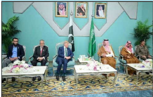
Governor Madinah Prince Salman Bin Sultan Bin Abdulaziz Al-Saud received Prime Minister Muhammad Shehbaz Sharif upon his arrival in Madinah Munawwarah.