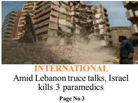
INTERNATIONAL Amid Lebanon truce talks, Israel kills 3 paramedics Page No 3