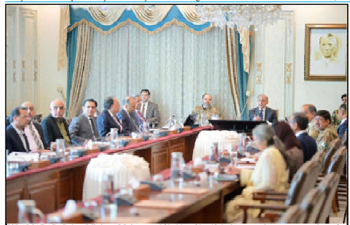
ISLAMABAD: Prime Minister Muhammad Shehbaz Sharif chairs a meeting on preparedness for Monsoon season and strategy to counter Climate Threats.

have witnessed the devastating consequences of floods, droughts and extreme weather events. These are not distant threats but present realities that affect the lives and livelihoods of our people," he added.