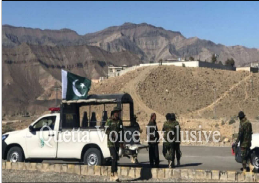
Balochistan: Security Forces Kill 3 More Terrorists in Zhob, Recover Weapons – ISPR