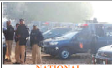
NATIONAL 3 SHOs suspended, probe ordered after 4 killed... Page No 8

SPORT Man City go top and relegate Burnley with narrow Turf Moor win Page No 7