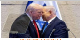
INTERNATIONAL Israel, Lebanon extend ceasefire as Trump seeks 'best deal' with Iran Page No 3