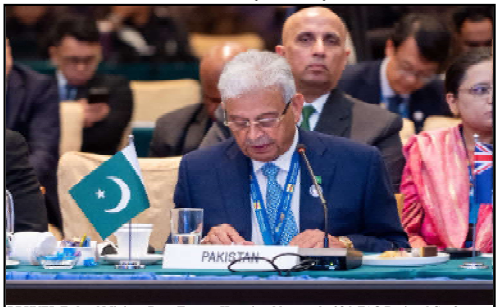
BRUNEI: Federal Minister Rana Tanveer Hussain addresses the 38th FAO Regional Conference, reaffirming Pakistan's commitment to sustainable agrifood systems and food security.

The multibillion-rupee project is a critical component of the China-Pakistan Economic Corridor's transport and logistics framework, supporting Pakistan's broader ambition to position itself as a regional trade and transit corridor connecting South Asia, Central Asia, and western China.