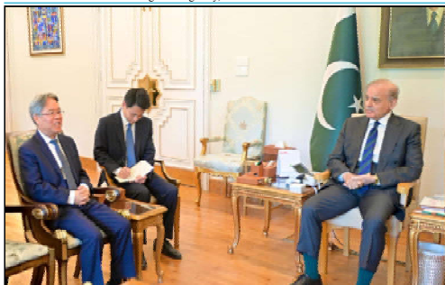
ISLAMABAD: Ambassador of China to Pakistan H.E. Jiang Zaidong called on Prime Minister Muhammad Shehbaz Sharif.

ponsorship of India, is also clear evidence of Indian state terrorism. According to experts, Pakistan has constantly presented irrefutable evidence of Indian state-sponsored terrorism to the international community. India is running a systematic campaign of terrorism and false propaganda abroad to sabotage regional peace, they maintained.