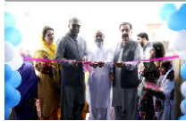
BALUCHISTAN CM Sarfraz Bugti Inaugurates First Women Market... Page No 5