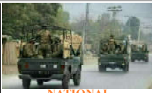
NATIONAL 22 terrorists killed in joint IBO in KP's Khyber, says... Page No 8

SPORT Najmul Hossain Shanto, Mustafizur Rahman fires Bangladesh seal ODI... Page No 7