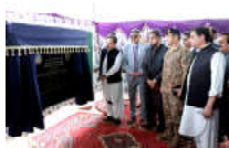
BALUCHISTAN Governor Mandokhail Inaugurates High Voltage... Page No 5