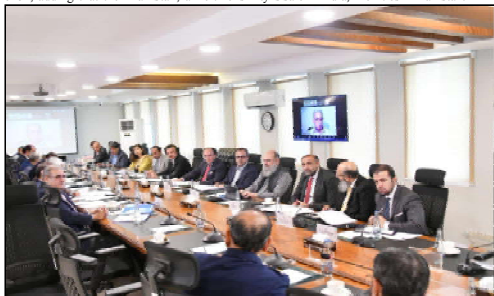
ISLAMABAD: Federal Minister for Finance and Revenue Senator Muhammad Aurangzeb chairing a meeting of the Economic Coordination Committee (ECC) of the Cabinet at the Finance Division today.

Officials have urged both citizens and the business community to ensure full compliance with the updated timings. The administration has emphasised that adherence to the new schedule is essential for maintaining order and supporting the city's ongoing efficiency measures.