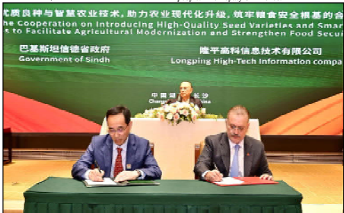
CHANGSHA, CHINA: President Asif Ali Zardari witnesses the signing of a MoU between the Local Government, Government of Sindh and Long Ping Hi-tech Information company in cooperation in agricultural technology.

He said that in Pakistan, people of all religions celebrate their festivals together. "Indian Illegally Occupied Jammu and Kashmir has been turned into a torture chamber, the Modi government is using the government machinery against minorities, and no minority is safe in India," he