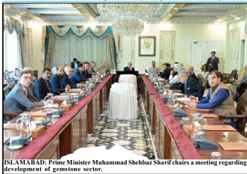
ISLAMABAD: Prime Minister Muhammad Shehbaz Sharif chairs a meeting regarding development of gemstone sector.

The DG said that a special enforcement campaign is underway across the province to ensure strict monitoring of juice and beverage production units during the summer season, when demand rises significantly and risks of adulteration increase. He reiterated that the authority is pursuing a zero-tolerance policy against the adulteration mafia and that strict legal action will continue against all violators without exception.