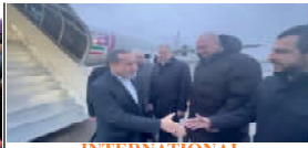
INTERNATIONAL Israel issues evacuation warning for seven Lebanese towns beyond... Page No 3