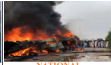
NATIONAL Fire breaks out in cargo truck on Indus Highway... Page No 8

SPORT Blistering Chapman steers United to Qualifier as sloppy Sultans falter Page No 7