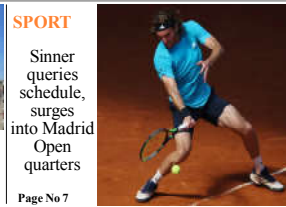
SPORT Sinner queries schedule, surges into Madrid Open quarters Page No 7