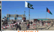
NATIONAL Pakistan launches retaliatory strikes after Afghan border... Page No 8