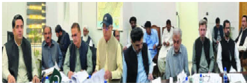
neering officers from all six zones participated in the meeting via Zoom.

Chief Engineer, Superintending Engineers, and district engineers