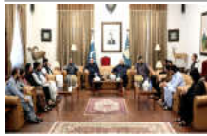
BALUCHISTAN Governor Balochistan Stresses Political Dialogue... Page No 5