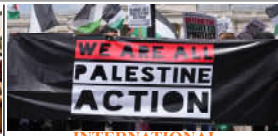
INTERNATIONAL UK government challenges lifting of ban on pro-Palestinian group Page No 3