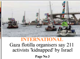
INTERNATIONAL Gaza flotilla organisers say 211 activists 'kidnapped' by Israel Page No 3