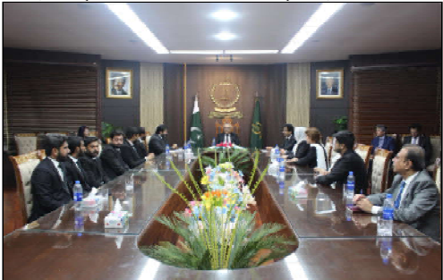
MULTAN: Hon'ble Chief Justice Justice Amin-ud-Din Khan addressing the delegation of Multan Bar Association at the Federal Constitutional Court of Pakistan.

resilience and unity shown by citizens in its aftermath. He added that following the disaster, Pakistan undertook major institutional reforms, including the establishment of the National Disaster Management Authority (NDMA), aimed at improving coordination and response capacity. The authority now uses geospatial technologies, historical data, and fault-line analysis to identify high-risk areas and support preparedness efforts. Prime Minister Sharif reaffirmed Pakistan's alignment with global frameworks such as the United Nations Office for Disaster Risk Reduction and the Sendai Framework for Disaster Risk Reduction 2015-2030, emphasizing equitable access to early warning systems and the development of earthquake-resilient infrastructure. He added that national priorities include strengthening community-level response capabilities, integrating disaster education into school curricula under the Pakistan School Safety Framework, and expanding the use of geographic information systems and satellite-based monitoring.