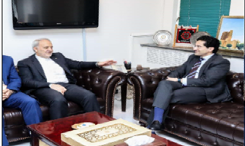
ISLAMABAD: Federal Minister for Petroleum Ali Pervaiz Malik was called on by the Ambassador of the Islamic Republic of Iran to Pakistan, H.E. Reza Amir Moghadam.