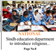
NATIONAL Sindh education department to introduce religious... Page No 8