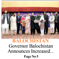
BALUCHISTAN Governor Balochistan Announces Increased... Page No 5