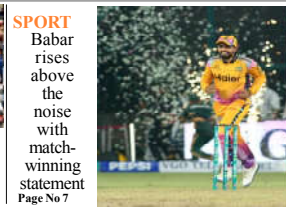
SPORT Babar rises above the noise with match- winning statement Page No 7

First Digital, Print Daily of Balochistan