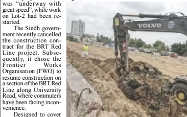
Designed to cover

quarters Hospital in the Seraf Naurang town. The police official said that the martyred cop was posted in Peshawar and had come to his native village on leave. "After the attack, a large police contingent reached the area and launched a search for the assailants," he added. Today's incident comes just a day after unknown terrorists attacked the house of a police official with explosives in the district's Shadkhal area, causing significant damage. Also in the Shadkhal area, a policeman embraced martyr-