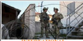
INTERNATIONAL Germany takes US troop drawdown in stride but deterrence gaps remain Page No 3