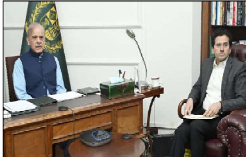
LAHORE: Prime Minister Muhammad Shehbaz Sharif chairs a meeting regarding power sector in Lahore.

Governor Kundi noted that the PPP has always given central importance to its youth wing, adding that active participation of young members is crucial for enhancing the party's outreach.