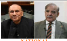
NATIONAL President, PM renew resolve to protect journalistic freedom... Page No 8