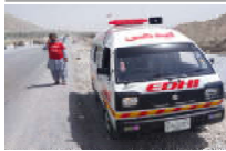
BALUCHISTAN 2 Security Men Injured in Duki Landmine Blast Page No 5