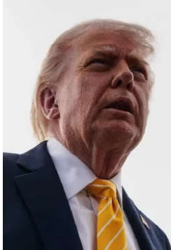
Trump says US could restart Iran strikes if they misbehave

Trump later extended the ceasefire without setting a new deadline, following a request from Pakistan.