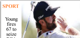
SPORT Young fires 67 to seize PGA lead Page No 7

First Digital, Print Daily of Balochistan