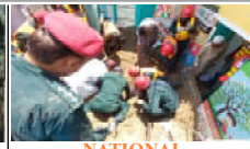
NATIONAL 4 children killed, 20 people injured as roof of classroom... Page No 8