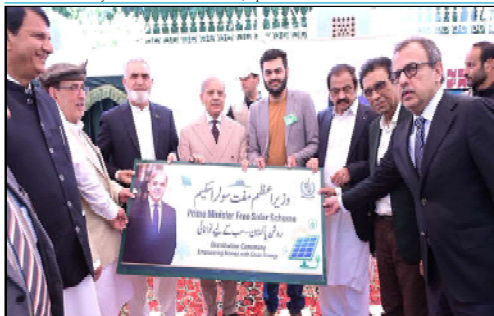
GILGIFT: Prime Minister Muhammad Shehbaz Sharif distributes solar panel under PM Free Solar Panel Scheme among beneficiaries from GB.

sectarian violence. He believed that the police uniform was not just a job—it was a responsibility to shield the public from chaos and fear. And in the end, he paid the ultimate price for that belief.