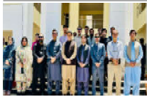
BALUCHISTAN Battle of Truth Ceremony Highlights National Unity... Page No 5