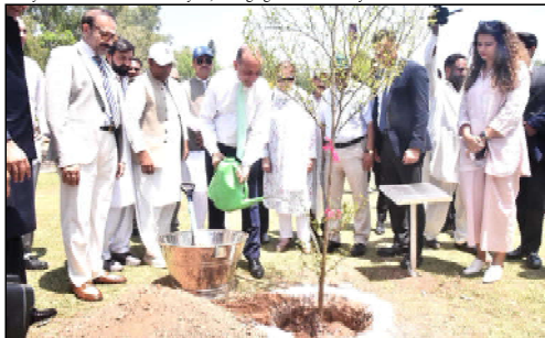
ISLAMABAD: Federal Minister for Climate Change and Environmental Coordination Dr. Musadik Malik participating in plantation drive under "Clean and Green Islamabad" initiative.

The lawyers said that since a jail trial was against the principles of justice, therefore, the couple should be heard in court for the hearing of their cases.