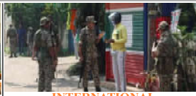
INTERNATIONAL Motorbike gunmen kill BJP political aide in India's West Bengal Page No 3