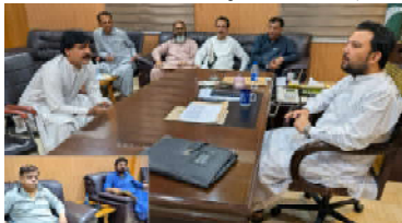
Participants reviewed in detail the medical facilities being provided to the public, the performance of government hospitals, action against absent doctors and paramedical staff. He ordered authorities to take immediate legal action against violators to eliminate risks to human lives. He further stated that the directives of the Chief Minister of Balochistan and the Chief Secretary are being implemented in letter and spirit, while reforms in the health sector remain under any circumstances. He warned that

medical staff, availability of medicines, challenges faced by healthcare centers, and implementation of government directives in the health sector. Officials briefed the deputy commissioner on existing health issues, service delivery, and difficulties faced by the public in accessing medical treatment. Addressing the