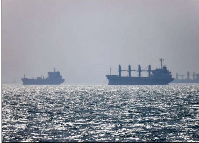
Regional tensions have escalated since the US and Israel launched strikes against Iran on Feb 28, triggering retaliation from Tehran against Israel as well as US allies in the Gulf, along with the closure of the Strait of Hormuz.