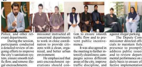
The meeting was attended by all Assistant Commissioners, officials from the Metropolitan Corporation Quetta, Traffic Police, QDA.