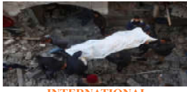
INTERNATIONAL 1 Palestinian child killed every week in West Bank since January 2025... Page No 3