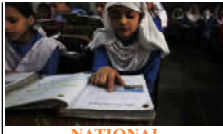
NATIONAL Sindh announces summer vacation for schools from... Page No 8