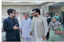
BALUCHISTAN Chairs Polio Campaign Review Meeting in Barshore Page No 5