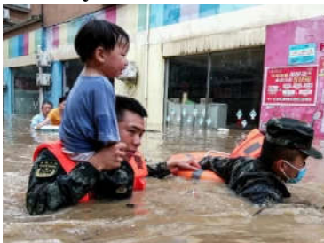
People wade through floodwaters in a village in China's southwestern region of Guizhou on Tuesday.