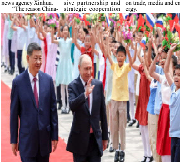
President Xi Jinping (right) and Russian President Vladimir Putin (left) talk during their meeting in Beijing, China, on Wednesday.

Many residents in Jingzhou, a city in central Hubei, were knee-