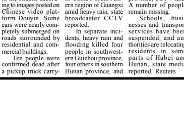
A flooded street in a village in China's southwestern region of Guizhou on Tuesday.