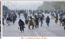
NATIONAL Opp rifts ahead of anti-govt protest Page No 8