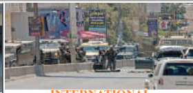
INTERNATIONAL Israeli occupiers establish new illegal settlement outpost in West Bank's... Page No 3