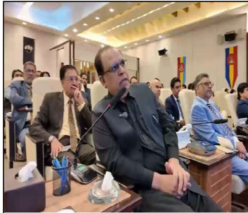
A Participant Asks A Question From Director General (DG) of Inter-Services Public Relations (ISPR) Lieutenant General Ahmed Sharif Chaudhry.

in strong hands and noted that not only the people of Azad Kashmir but also those in Indian Illegally Occupied Jammu and Kashmir take