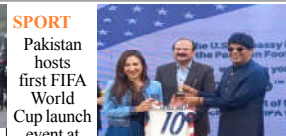
SPORT Pakistan hosts first FIFA World Cup launch event at U.S. Embassy Page No 7

First Digital, Print Daily of Balochistan