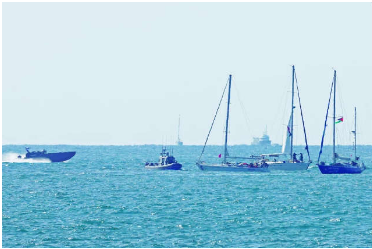
Turkey this week before being intercepted on Wednesday.

Past flotillas - including one carrying Swedish activist Greta Thunberg - were also intercepted by Israel, with participants later deported.