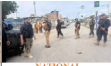
NATIONAL 12 terrorists killed, one person dead in heavy fighting... Page No 8