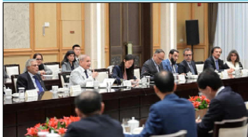
JIANGZHOU (China): Prime Minister Muhammad Shehbaz Sharif meets Wang Hao, Party Secretary of the CPC Zhejiang Provincial Committee in Hangzhou.

tion and Cooperation of China's Ministry of Education. The Pakistan regional final was organized under the auspices of the Chinese Embassy in Pakistan.