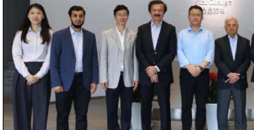
JIANGZHOU (China): Special Assistant to Prime Minister on Industries and Production (SAPM) Haroon Akhtar Khan and Federal Minister for National Food Security and Research, Rana Ishaq Hussain, meet Mayor of Changzhou.

The court expressed serious concern over the failure of the Port Qasim Authority to issue a seniority list for seven years after the confirmation of employees.