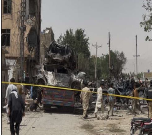
A view of the destruction caused by the deadly bombing in Quetta: Photo Muhammad Ismail

Syed Ali Shah, News Desk: QUETTA: A powerful explosion struck a passenger shuttle train near Chaman Phatak in Quetta on Sunday morning, leaving at least 14 people dead and several others injured, while causing widespread destruction in the surrounding area. According to officials, the shuttle train was traveling from Quetta Cantonment toward the city railway station when the explosion occurred shortly after 8:00 AM. Authorities confirmed that among those killed were three personnel of the Frontier Corps, while women and children were also reported among the injured. The blast scene quickly turned chaotic as emergency responders, rescue teams, and local residents rushed to assist victims. Bodies of the deceased were shifted to hospitals, while injured passengers and civilians were evacuated for urgent medical treatment. In response to the incident, authorities declared a medical emergency across Quetta hospitals, directing doctors, paramedics, and medical staff to report for immediate duty to handle the growing number of casualties. The impact of the explosion extended beyond the train, leaving visible destruction across the area. Several train coaches were badly damaged, with reports indicating derailment and overturned compart-