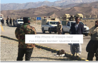
File Photo of troops near Pakistan-Afghan border

NEWS DESK: Security forces killed 11 terrorists during a series of intelligence-based operations (IBOs) conducted over the past 48 hours in the Datta Khel area of Khyber-Pakhtunkhwa's North Waziristan district, the military's media wing said on Sunday. A statement from Inter-Services Public Relations (ISPR) stated that security forces engaged "multiple Khawarji locations" in the area, leading to "intense and fierce exchanges of fire." "11 Khawarji belonging to Indian-sponsored Fitna al-Khawarji were effectively neutralised during the operations," it said. Fitna al-Khawarji, a term used also by the state for terrorists associated with the banned Tehreek-e-Taliban Pakistan. The statement further added that weapons and ammunition were recovered from the terrorists, who had been "actively involved in numerous terrorist activities in the area." The military said sanitisation operations were continuing to eliminate any remaining terrorists from the area.