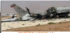
INTERNATIONAL Congressional report details losses of 42 US aircraft in Iran campaign Page No 3