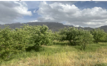
The temporary ban applies with immediate effect to the following popular recreational and tourist sites located on the outskirts of Quetta: Hanna Urak, Hanna Lake, and Sra Khula.

Staff Reporter: QUETTA: The district administration of Quetta has announced a temporary ban on public access to several major picnic points and tourist destinations across the district, citing the current law and order situation and security arrangements for an upcoming event. According to an official notification issued by the Deputy Commissioner (DC) of Quetta, the restrictive measures have been put in place by the administration specifically in view of the scheduled wrestling event and broader security protocols in the