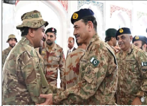
Field Marshal Syed Asim Munir, NI (M), HJ, COAS & CDF, visited Zhob District, Balochistan to celebrate Eid-ul-Adha with frontline troops deployed along the Western frontiers, the military's media wing said

Referring to the recent cowardly terrorist incident in Quetta orchestrated by Indian-sponsored Fitna-al-Hindustani and its proxies, the Field Mar-