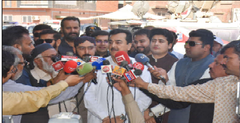
MULTAN: Senate Chairman Syed Yousuf Raza Gilani is speaking to media representatives at the shrine of Hazrat Musa Pak Shaheed (RA) on the occasion of Eid-ul-Adha.

Pakistan's defence minister said that President Trump has been successful because of his unconventional approach. "His all peace