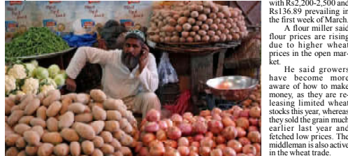
Fast-Moving Consumer Goods sector faces tax strain

He said growers have become more aware of how to make money, as they are releasing limited wheat stocks this year, whereas they sold the grain much earlier last year and fetched low prices. The middleman is also active in the wheat trade.