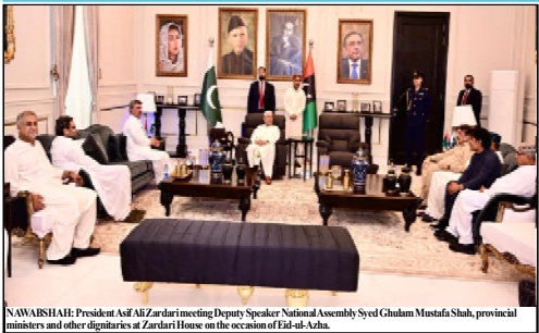
NAWAB SHAH: President Asif Ali Zardari meeting Deputy Speaker National Assembly Syed Ghulam Mustafa Shah, provincial ministers and other dignitaries at Zardari House on the occasion of Eid-ul-Azha.

registered organisations can be verified through the QR code printed on their certificates. The Home Department said deputy commissioners will issue permits to madrassas and charitable organisations for the collection of sacrificial hides. Citizens have been asked to ensure that hides are given only to institutions holding a valid Punjab Charity Commission certificate or a permit issued by the deputy commissioner. The department said people must ensure their donations reach deserving beneficiaries instead of terrorists or extremist networks.