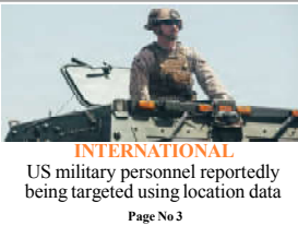
INTERNATIONAL US military personnel reportedly being targeted using location data Page No 3