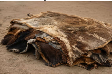
Sacrificial animal remains. Officials informed the meeting that approximately 4,294 tons of waste are expected to be generated across Quetta during the three days of Eid-ul-Adha.

A comprehensive waste management and sanitation operation plan has been approved, with 9,500 small and heavy machines deployed for garbage collection and disposal activities. The provincial government has also decided to arrange additional machinery on rent for the disposal of animal waste in all district and divisional headquarters across Balochistan. The Eid-ul-Adha Security Plan 2026 has been finalized. Authorities expect Eid prayers to be offered at 54 major Eidgahs and mosques in Quetta. A dedicated Security Monitoring Control Room has been established to oversee law and order during the Eid holidays.