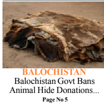
BALUCHISTAN Balochistan Govt Bans Animal Hide Donations... Page No 5