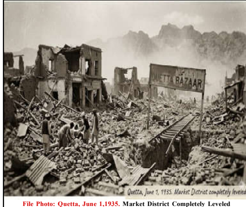
File Photo: Quetta, June 1, 1935. Market District Completely Levelled

remain alarmingly low. Will History Repeat Itself? Quetta's population has ballooned from a few thousand in 1935 to millions today. Yet, our structural resilience has