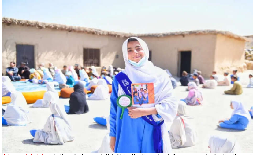
A teenage student stands inside a school campus in Balochistan. Despite ongoing challenges in access to education, thousands of girls across the province continue to pursue their studies.

Chief Minister warned that if a single child is found sitting on a mat after the designated timeline, strict disciplinary action will be taken.