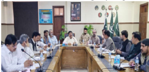
PDMA officials and government representatives during the Monsoon Contingency Plan 2026 review meeting.

Evacuation and Coordination Mechanisms. Detailed discussions were held on evacuation plans, emergency relief operations, and coordination mechanisms among various departments to ensure a swift and organized response during any potential disaster situation. Participants stressed the need for clear communication channels and well-defined operational roles to minimize delays during emergencies.