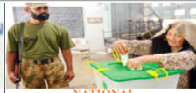
NATIONAL Gilgit-Baltistan elections begin as 130 candidates contest 24 seats