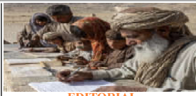
EDITORIAL Balochistan's Historic Shift to Merit-Based Government Jobs:...