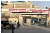
FRONT PAGE Quetta Acid Attack on Female Doctor: CM...