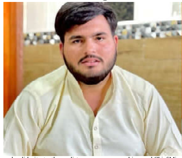
and solidarity to the family of the slain journalist. The BUJ leadership urged Chief Minister Balochistan Mir

Sarfraz Bugti and Provincial Interior Minister Mir Sarfraz Bugti, Deputy Commissioner Farida Tareen has issued strict directives to maintain control over the prices of essential commodities and ensure relief for consumers.