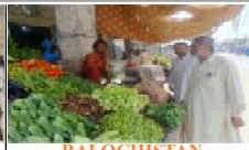
BALUCHISTAN Sohbatpur Administration Cracks Down on Overpricing..