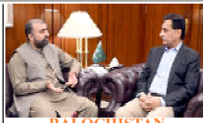
BALUCHISTAN National Assembly Speaker Ayaz Sadiq, Balochistan CM...