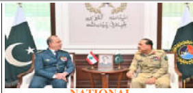
NATIONAL CDF Munir, Lebanese army chief review regional security, defence...