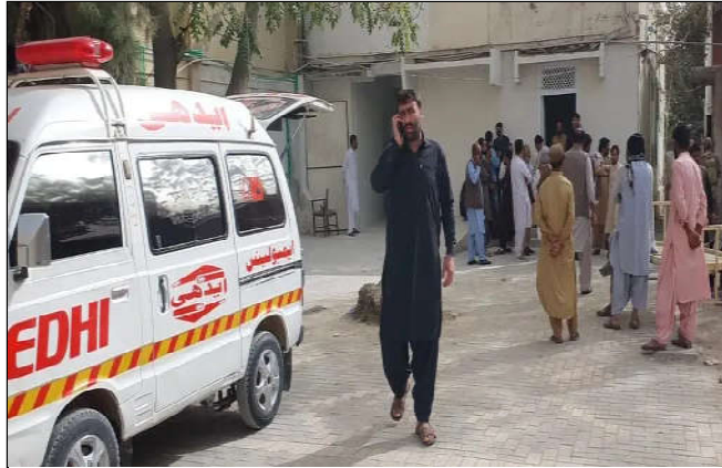
File Photo: A man speaks on mobile in the aftermath of a blast in Quetta

An FIR has been registered, while investigators have begun collecting evidence and recording statements to establish the motive behind the inci-