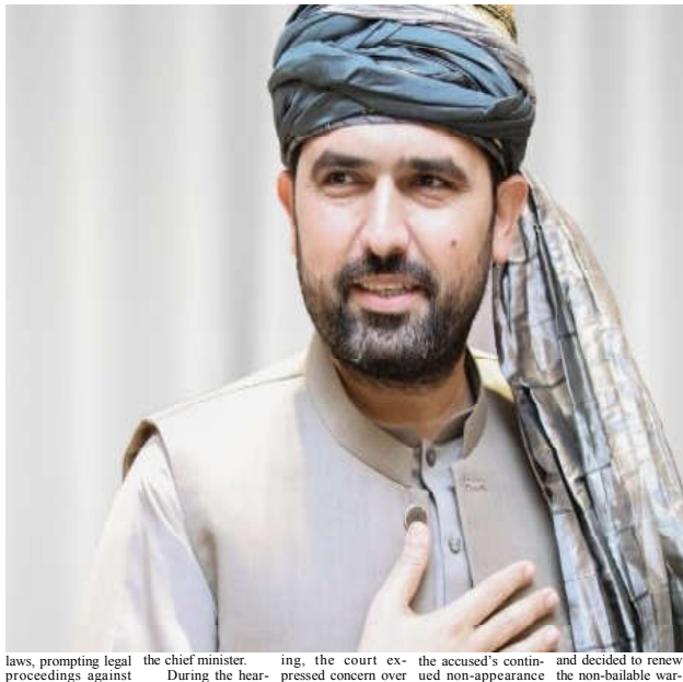
the chief minister. During the hearing, the court expressed concern over the accused's continued non-appearance and decided to renew the non-bailable warrants. The matter was subsequently ad-

Authorities claim the material violated provisions of Pakistan's cybercrime