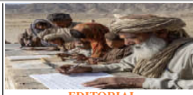
EDITORIAL Balochistan's Historic Shift to Merit-Based Government obs...