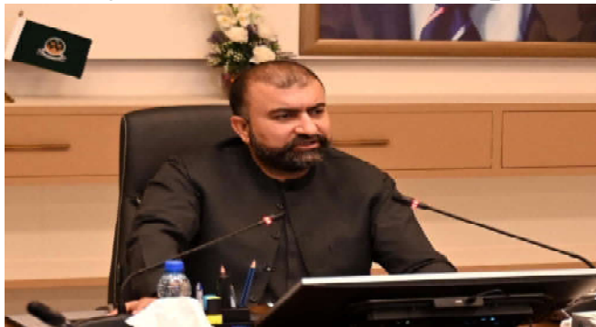
Chief Minister Balochistan, Mir Sarfraz Bugti chairing the meeting of the provincial cabinet

In a bid to pull in more international aid, all foreign-