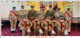
NATIONAL Pakistan secures top position at international military drill...

First Digital, Print Daily of Balochistan