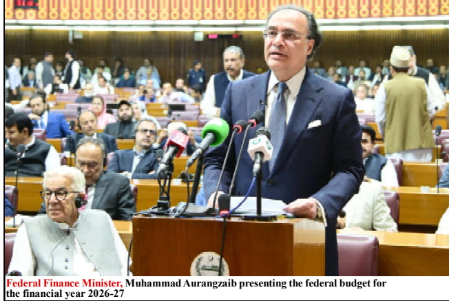
Federal Finance Minister, Muhammad Aurangzeb presenting the federal budget for the financial year 2026-27

The finance minister said the government was also focused on