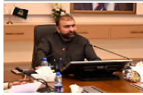
FRONT PAGE Balochistan Local Polls Set for Feb 2027: Tax Breaks...