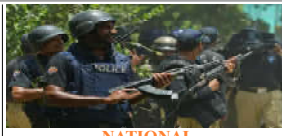
NATIONAL 5 suspected terrorists killed during intelligence-based operation in... Page No 4

First Digital, Print Daily of Balochistan