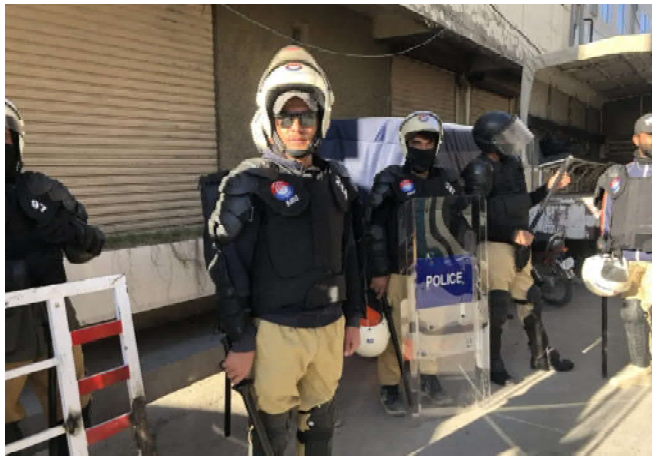
Policemen stand alert to maintain law and order situation in Quetta

To strengthen security arrangements during the holy month, authorities have also imposed a ban on the public display and carrying of arms