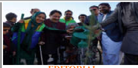
EDITORIAL Balochistan's Tree Plantation Drive Must Go Beyond Ceremonies Page No 2