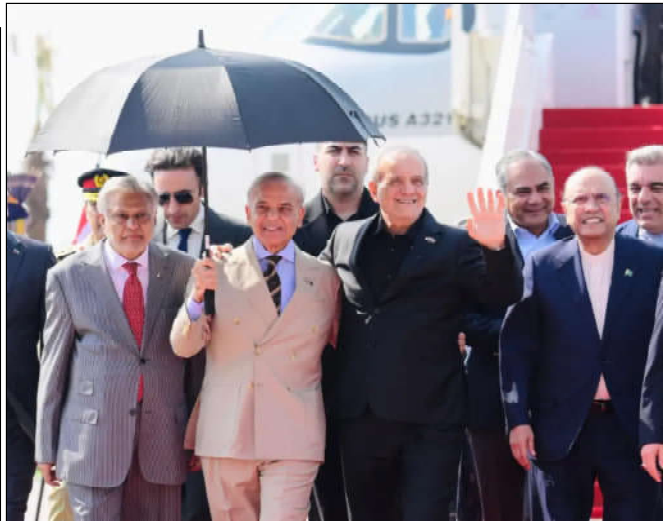
President Asif Ali Zardari, Prime Minister Shehbaz Sharif, Deputy Prime Minister and Foreign Minister Ishaq Dar and others receive Iranian President Masoud Pezeshkian upon his arrival in Islamabad on June 23.

He further claimed that opposition parties had repeatedly declined opportunities to participate in parliamentary committees despite being invited on multiple occasions. Later, the National Assembly Secretariat issued a statement quoting Speaker Sadiq as