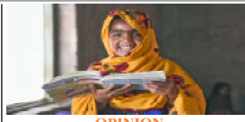
OPINION IRC reaches to 29,000 out of school girls in Balochistan Page No 2