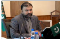
FRONT PAGE Balochistan CM Orders Probe into Quetta... Page No 1