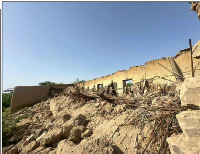
Five Earthquakes in 48 Hours: Seismic Swarm Rocks Balochistan.