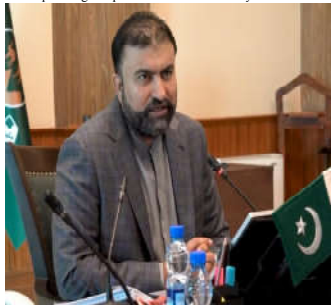
File photo of: Balochistan Chief Minister Mir Sarfraz Bugti has ordered a Special Investigation Unit (SIU)

He reiterated that authorities have been instructed to arrest the suspects without delay and deliver justice to the victim's family.