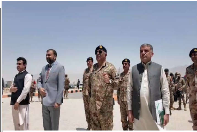
Quetta: Balochistan Chief Minister Mir Sarfraz Bugti visited Girls Cadet College Quetta along with Corps Commander Balochistan Lt Gen Rahat Naseem Ahmed Khan