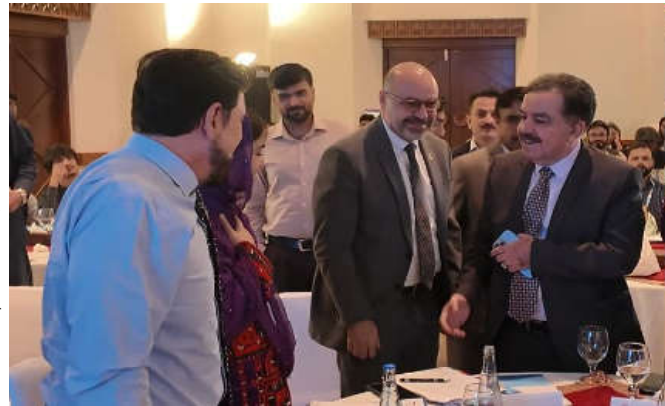
File Photo: Governor Balochistan has said Chief Minister Mir Sarfraz Bugti will complete his full five-year constitutional term

"The two-and-a-half-year arrangement is not that important. We should think more