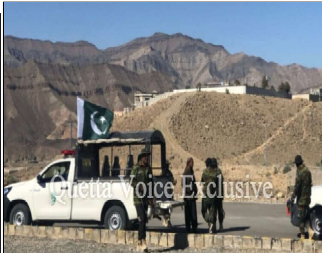
Frontier Corps personnel stand alert near Pak Afghan border