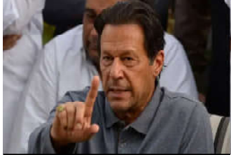
File photo: Former prime minister Imran Khan in the £190 million corruption case.