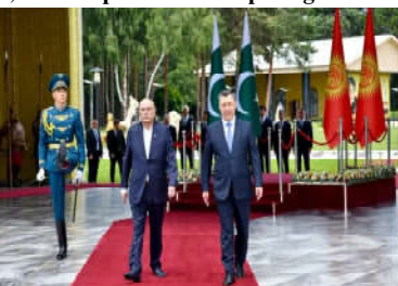
President Asif Ali Zardari and Kyrgyzstan President Sadyr Zhaparov during their meeting.

He added that LPG officially priced at Rs241 per kilogramme, was being sold for as much as Rs500 per kilogramme, while electricity, fuel and food prices continued to rise.