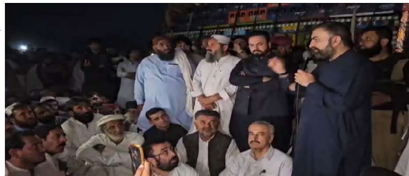
CM Sarfraz Bugti Storms Tense Ziarat Cross Sit-In to Confront Protesters Face-to-Face

While official state channels are already claiming a breakthrough—announcing the formation of a high-level com-