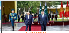
NATIONAL Pakistan, Kyrgyzstan reaffirm commitment to boosting bilateral... Page No 4

First Digital, Print Daily of Balochistan