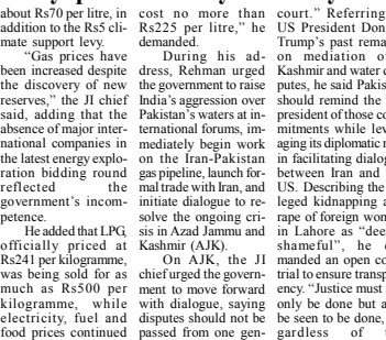
JI chief Hafiz Naecrum Rehman speaking at a press conference.

Joint ventures in the pharmaceutical production and facilitation of market access through closer cooperation between the respective drug regulatory authorities, the digital economy, information and communication technologies,