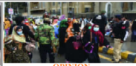
OPINION Forced Marriage in Islam: A Clear Violation of Women's Rights and... Page No 2