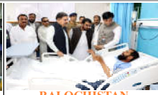
BALUCHISTAN Governor of Balochistan Visits New Trauma Center, ... Page No 3