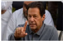
FRONT PAGE IHC grants final adjournment to Imran's counsel in £190m... Page No 1