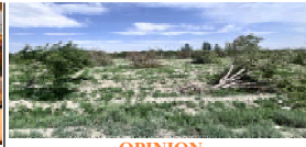
OPINION Balochistan: Qila Saifullah Hailstorm Destroys 7M Fruit Trees, 18,000... Page No 2