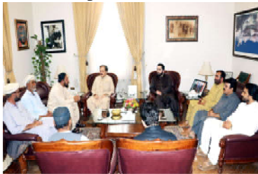
table development difficult to achieve.

Speaking to various delegations at the Governor House in Quetta, Governor Mandokhail said that policymakers and elected representatives have a crucial role in ensuring balanced development and reducing disparities between cities and rural communities. We need a comprehensive strategy that guarantees equal access to basic facilities and opportunities for all citizens," he said, adding that without a clear vision and sound planning, the divide between villages and major urban centers would continue to widen, making equi-