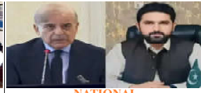
NATIONAL KP CM urges PM Shehbaz to defer proposed withdrawal of tax... Page No 4

First Digital, Print Daily of Balochistan