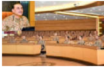
FRONT PAGE Field Marshal Says Pakistan Will Crush... Page No 1