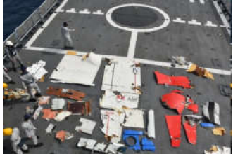
Wreckage of the K2 Airways cargo plane that went missing on Tuesday night.