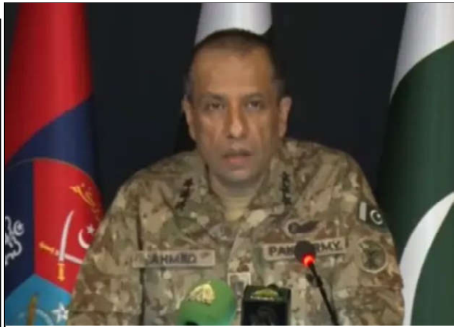
Balochistan Attacks: 42 Martyred, 54 Terrorists Killed in Intense Security Operations, Says DG ISPR.

Earlier, upon his arrival at the National Defence University, the Field Marshal was received by the university's president, the ISPR added.